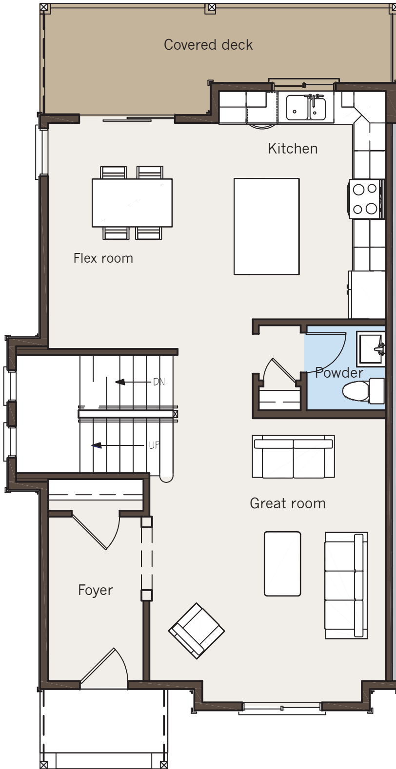
Main (848 Sq Ft)