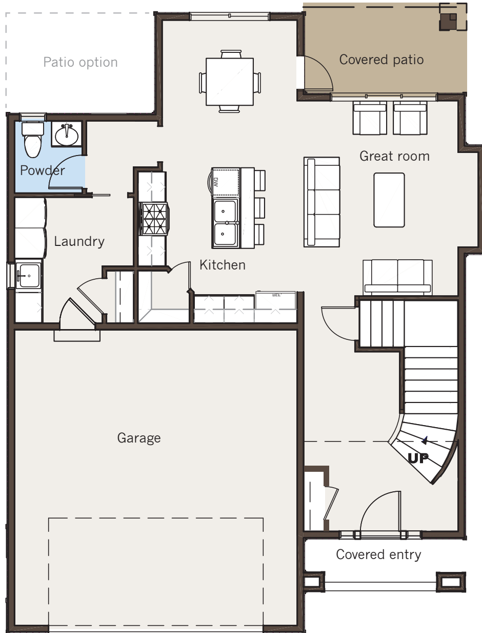
Main (803 sq.ft.)