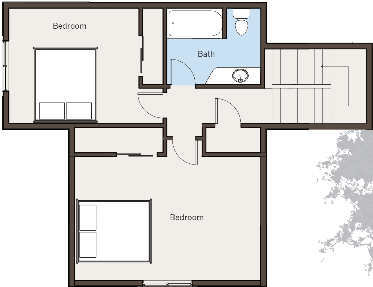
Upper (518 Sq Ft)