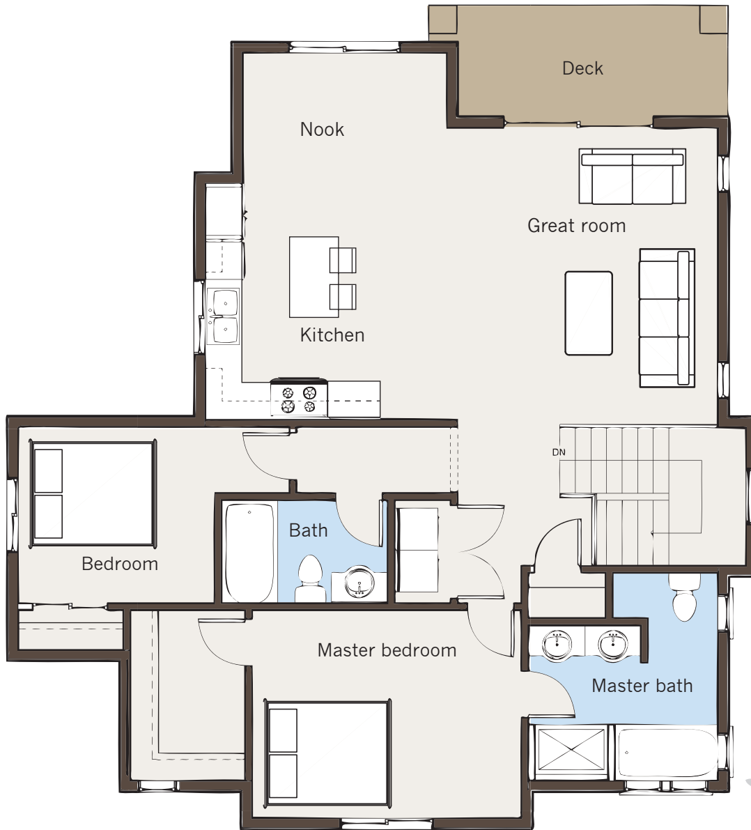
Main (1,280 Sq Ft)