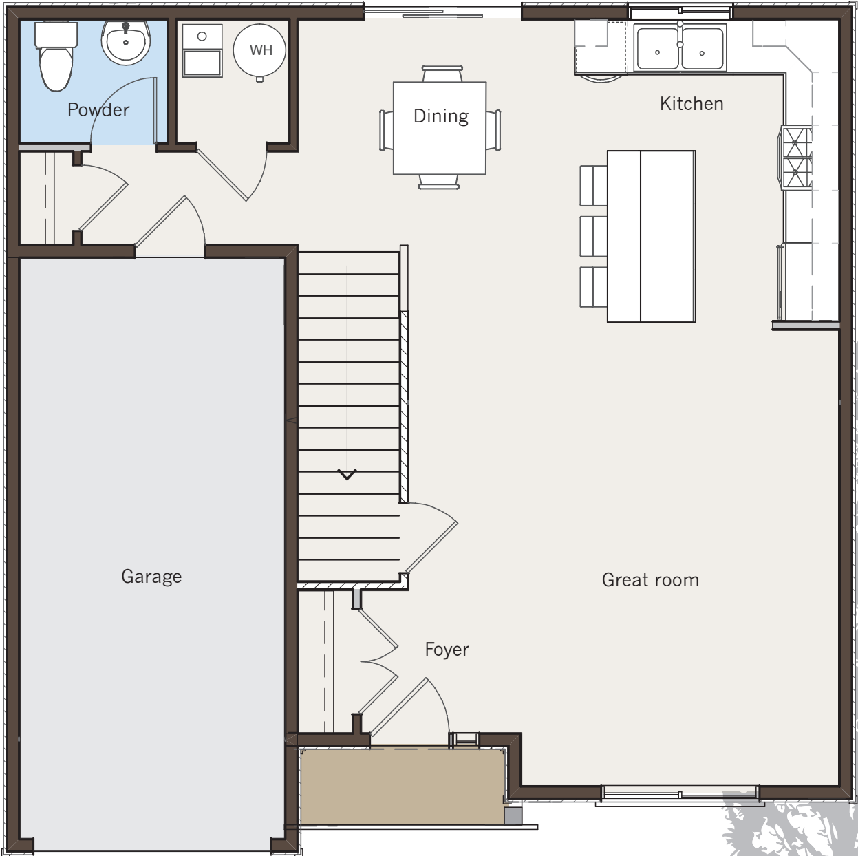
Main (727 Sq Ft • Garage 239 Sq Ft)